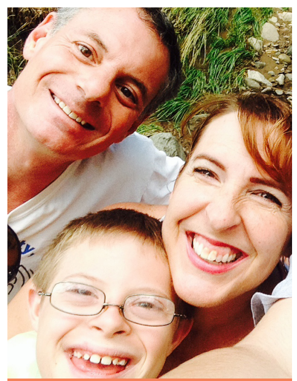
"One of the most important things I've learned from Raising Special Kids is that parents are valuable members of any team decision-making process."